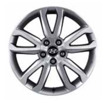
Alloy wheel kit 18"

Sporty but chic at the same time, they deliver outstanding driving stability and durability. 7.5Jx18, suitable for 235/60 R18 tyres. 2WF40AC180